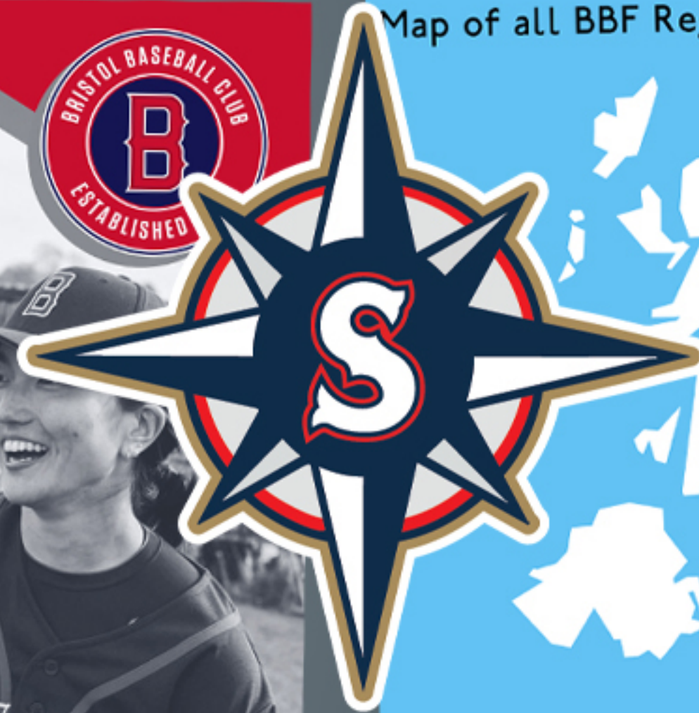
Map of all BBF Registered Baseball Clubs for 2026